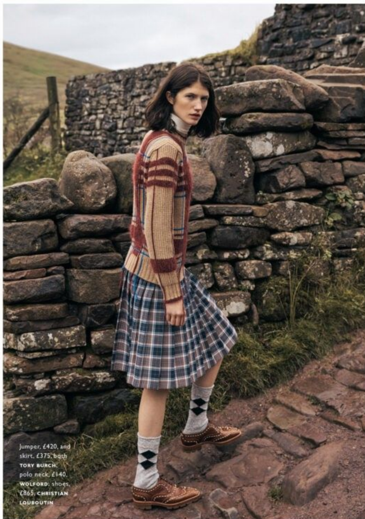
Jumper, £420, and skirt, £375, both TORY BURCH; polo neck, £140, WOLFORD; shoes, £865, CHRISTIAN LOUBOUTIN