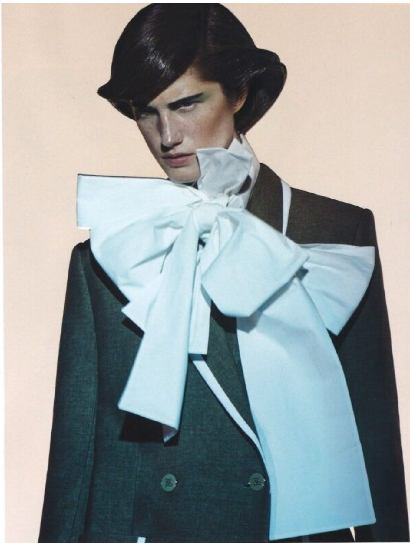
Doppiopetto con profili a contrasto e camicia in cotone con fiocco. Fendi . Pagina accanto. Trench (199,90 euro) e pantaloni in ecopelle (95 euro). Kocca . Sneakers in pelle e suède (360 euro). Hogan .