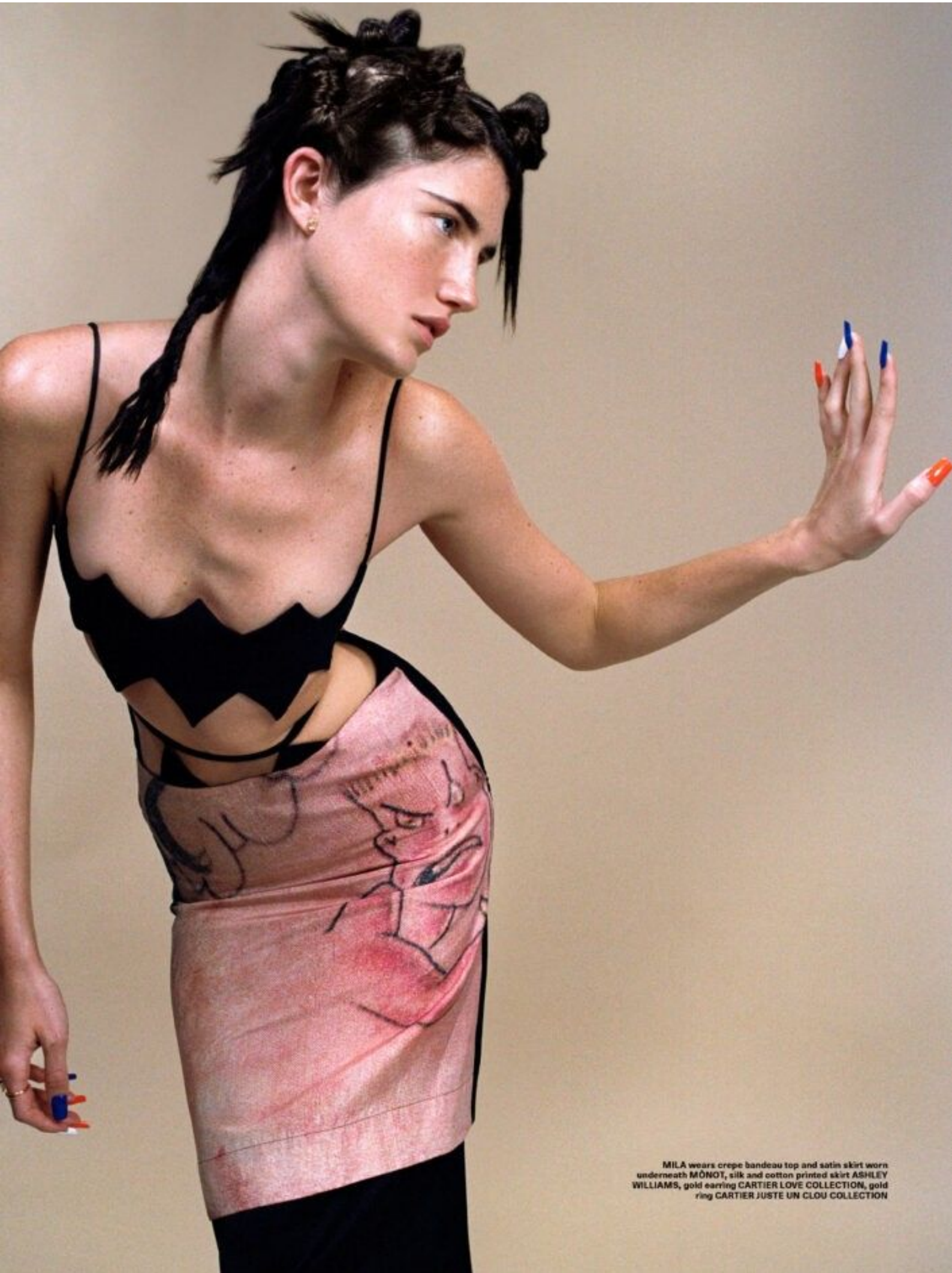
MILA wears crepe bandeau top and satin skirt worn underneath MÔNDI, silk and cotton printed skirt ASHLEY WILLIAMS, gold earring CARTIER LOVE COLLECTION, gold ring CARTIER JUSTE UN CLOU COLLECTION