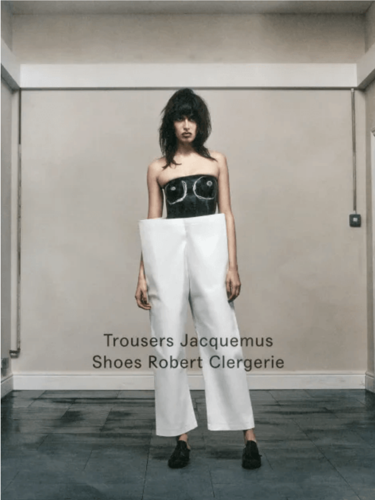
Trousers Jacquemus Shoes Robert Clergerie