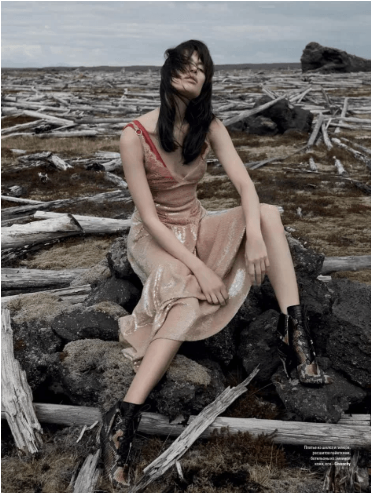
Платье из шёлка и гипюра, расшитое пайетками, босоножки из замшевой кожи, все — Swatchy