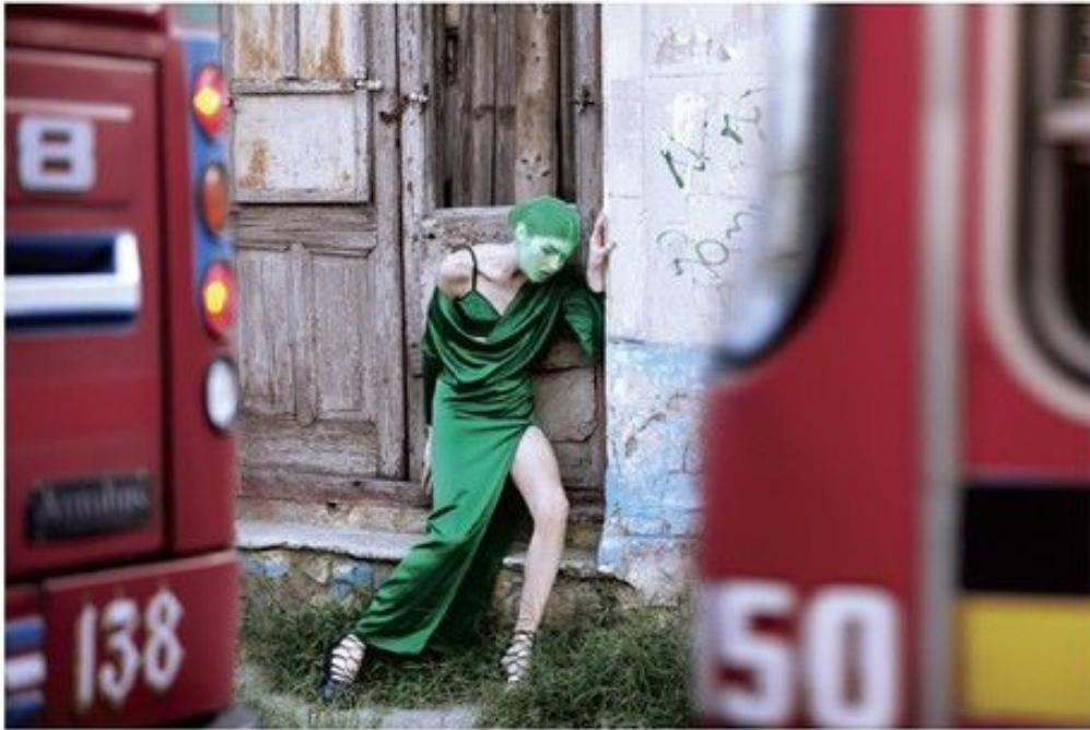
Dress and Iris Jean Paul Gaultier Shoes Alexander McQueen Vet made by stylist